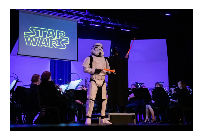
The Barton Concert Band plays while a Storm Trooper guards guest director Darth Vader at the first "Night at the Movies" concert in 2019.

This year's interactive experience will feature the Prairie Winds Concert Band, Barton Jazz Ensemble, and Barton's rock band "The Riff" performing popular music from well-known blockbuster film soundtracks.