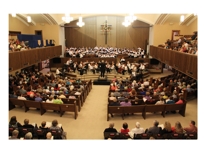
The Central Kansas Community Choir performs in 2013.

<u>bartonccc.booktix.com</u>. The event will also be live-streamed at <u>shows.bartonccc.edu</u>.