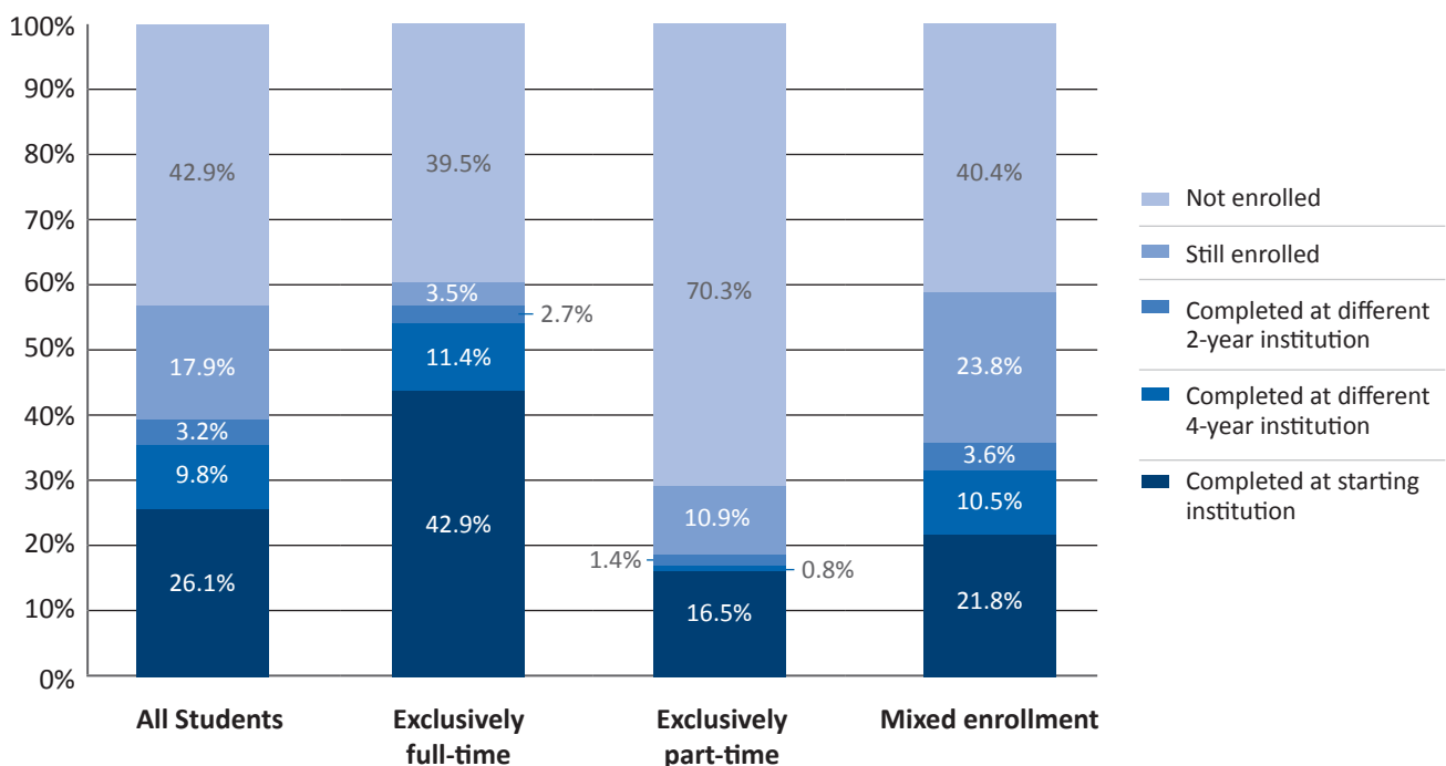
Figure 1: Six-year outcomes for students who started at a 2-year public institution by enrollment intensity

The Department of Education’s official graduation rate is widely acknowledged to be a poor measure of student completion, especially for community colleges. The primary reason is that it measures completion for only a subset of students, and, in the case of community colleges, a very small percentage of students. The graduation rate applies only to students who enroll in the fall, are first-time degree/certificate-seeking undergraduates, attend full time and complete within 150% of normal program completion time at the institution in which they first enrolled. The majority of community college students attend part time. Many are not first-time students, nor do they first enroll in the fall. Some community college students are not degree- or certificate-seeking and many others intend to transfer to another institution to pursue their degree. AACC commends ED for introducing in the future additional graduation rate measures for part-time and transfer students, which will address some of the aforementioned shortcomings. AACC also continues to advocate for changes to the Higher Education Act when Congress reauthorizes it.