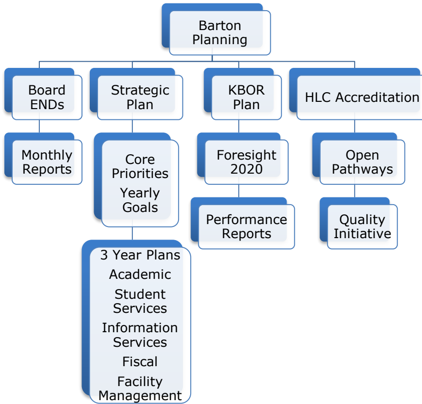
Three Year Academic/Student Services/Information Services/Facilities Plans of Work Model

The following charts summarize the planning process.