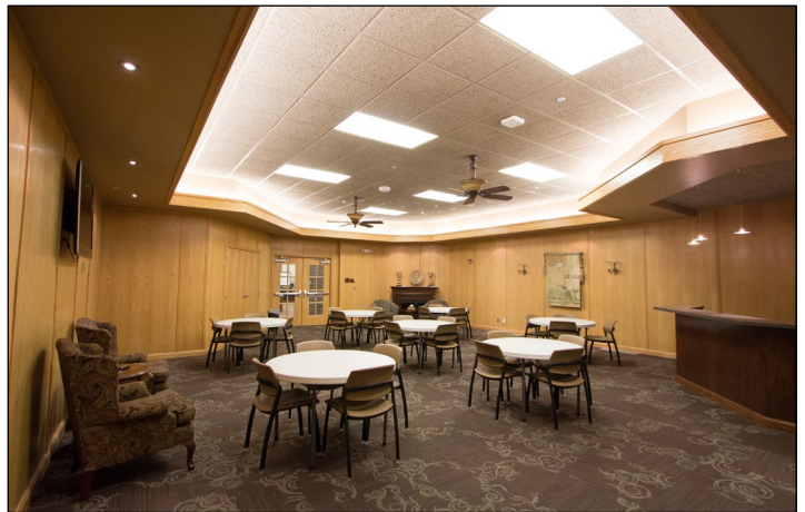
Plaza De Cavanaugh Community Room located in the Learning Resource Center.