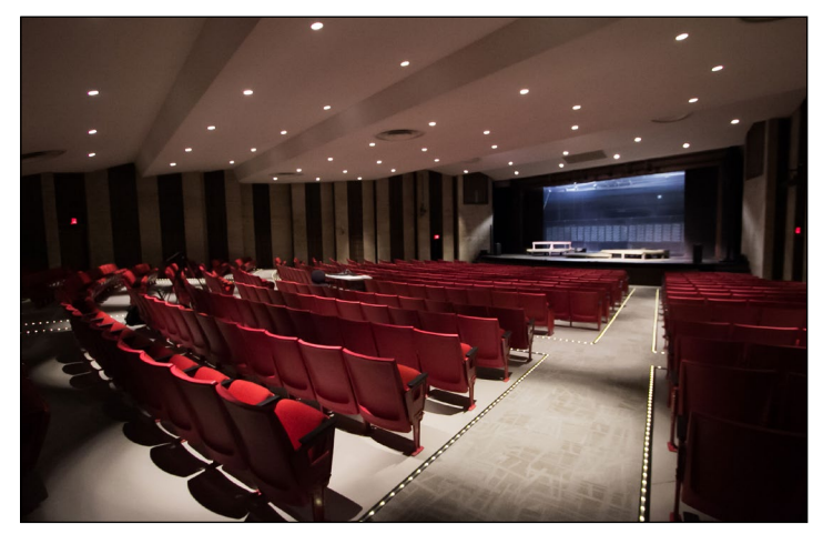
Newly renovated Performing Arts Auditorium located in the Fine Arts Building.

We could have shown them so much more but we'll have to save it for another day and time. It is always a pleasure for us to show our contributors what great things can happen when they support our efforts and we partner in our initiatives to continue to be a strong and premier community college, benefitting anyone who wants to pursue their educational accomplishments.