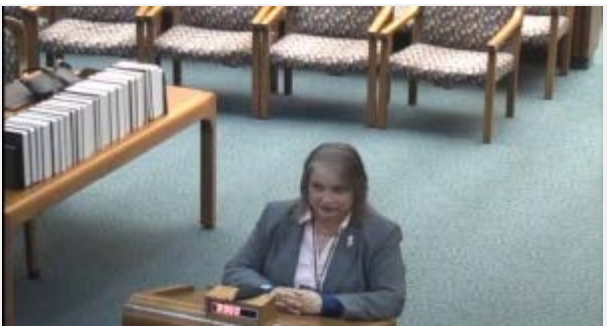
Topeka lawyer for elderly women takes Fifth, disbarred amid ethics questions