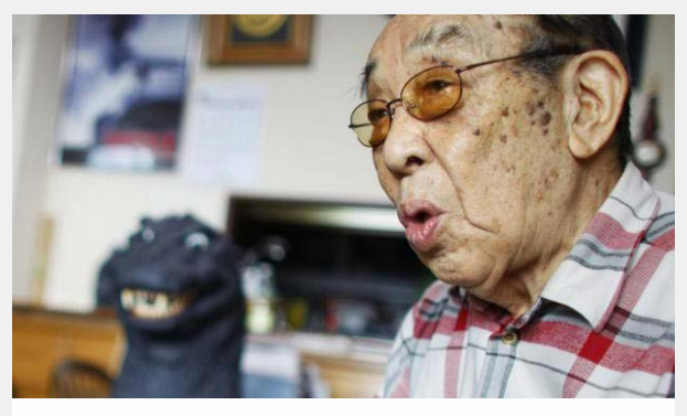
about an hour ago

Glen Campbell, superstar entertainer of 1960s and '70s, dies at 81