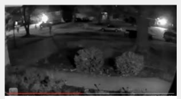
West Topeka cars broken into overnight