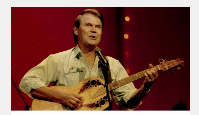
about an hour ago

Glen Campbell, superstar entertainer of 1960s and '70s, dies at 81