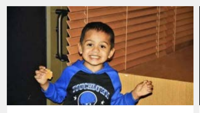
Records: Slain Kansas boy who was fed to pigs told Missouri authorities about abuse