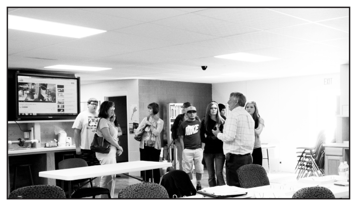
All About Career attendees visit the Midwest Utility and Pipeline Training Center, which houses Natural Gas classes.