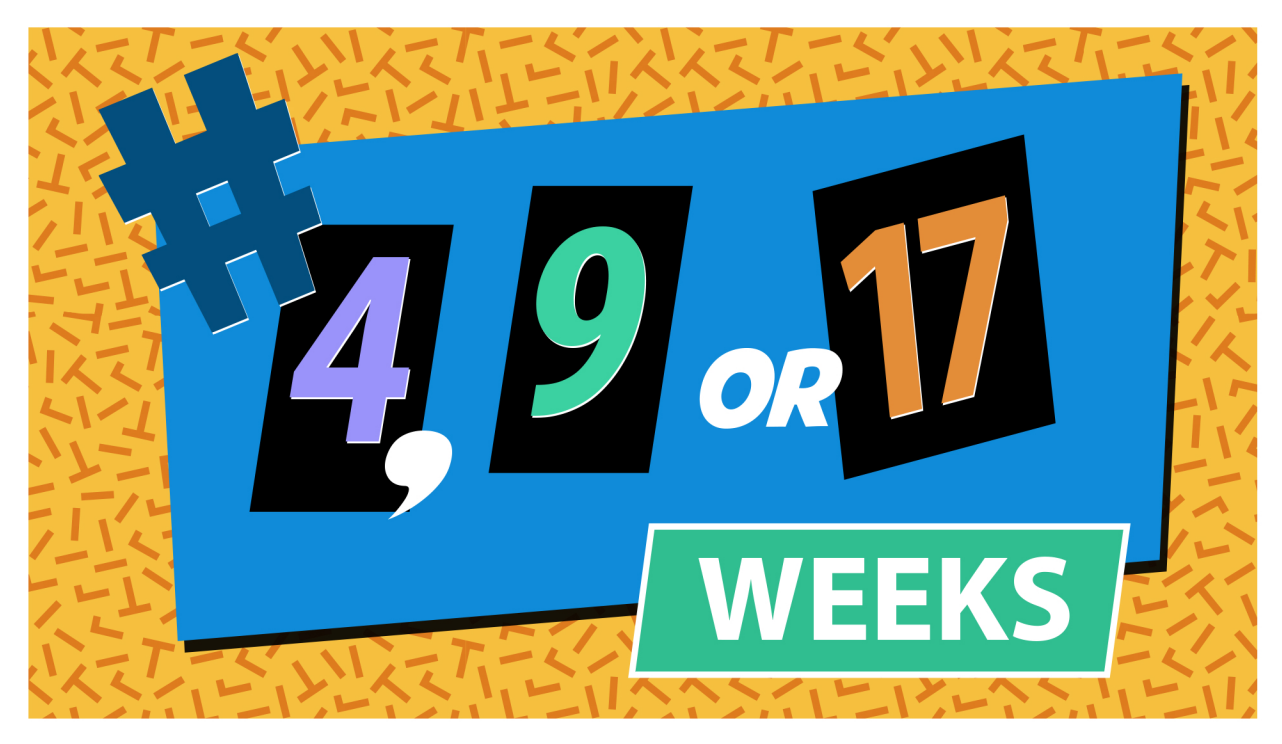
... with convenient 4, 9, and 17 week sessions — then transfer when you're ready!

Don't put your life on hold! (phone hold sound or elevator music)