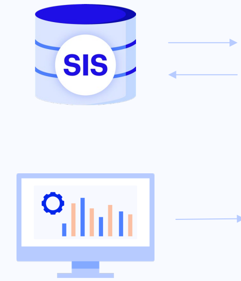
External Data Sources (e.g. learning outcomes)