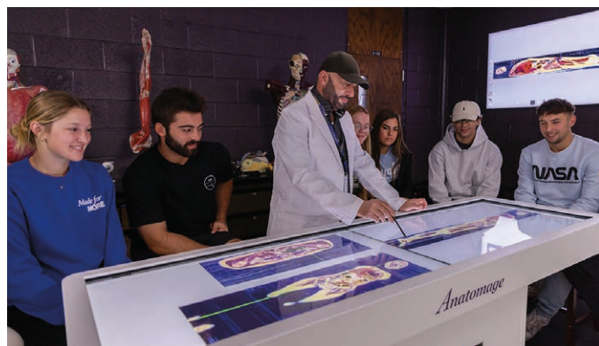
Anatomage Table, purchased by the Foundation

The Foundation coordinates multiple friend- and fund-raising activities and events each year to benefit the college and encourages private donors and organizations to support Barton. For more information on how you can advance academics through the Barton Community College Foundation, contact us at (620) 792-9306, foundation@bartonccc.edu , or 245 NE 30 RD, Great Bend, KS 67530. All donations are tax deductible.