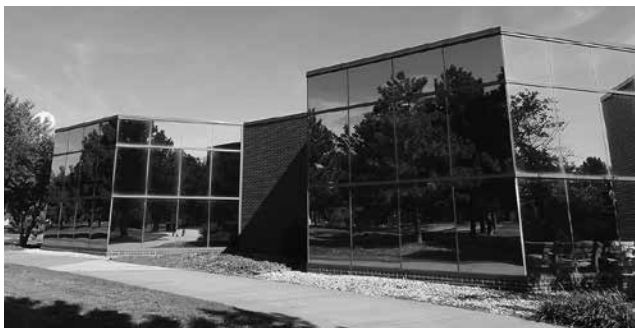
Barton Community College

The local citizenry and the college's faculty, staff and students put the "community" in Barton Community College and have spread its influence across the state and nation. The college has earned a reputation for its responsiveness to community needs, its adaptability to the changing environment, and its commitment to learning as a lifelong process.