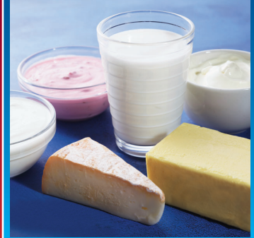
Milk and Milk Products Low-fat and Fat-free

Increased intakes of fruits. vegetables, whole grains and fat-free or low-fat milk and milk products are likely to have important health benefits for most Americans, according to the Dietary Guidelines. They are encouraged for a healthful diet and are sources for specific nutrients of which many Americans are not getting enough calcium, potassium, fiber, magnesium, vitamins A, C and E.