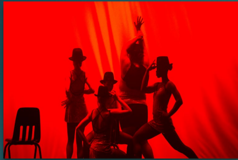
Barton Jazz Dance Class