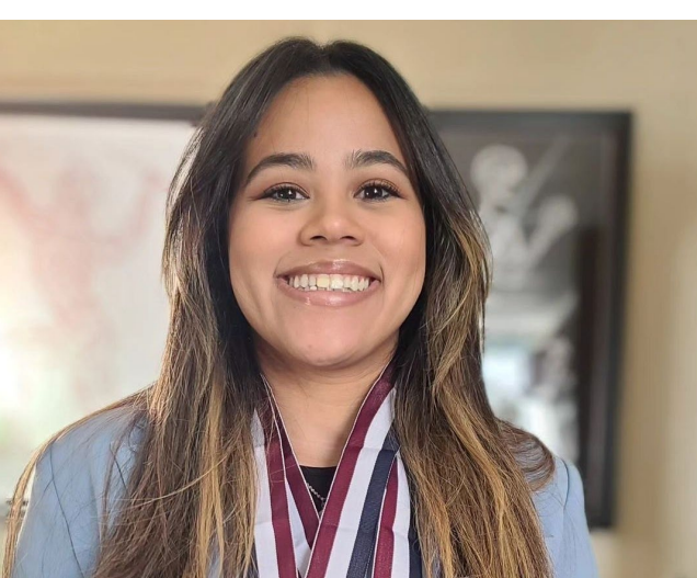
Pre-Pharmacy and EMS students

Sports Medicine and Pre-Nursing students